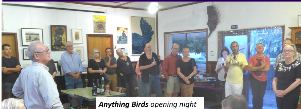
Anything Birds opening night

(If you don't have web access contact Treasurer Leanne Wright 4997 7201)