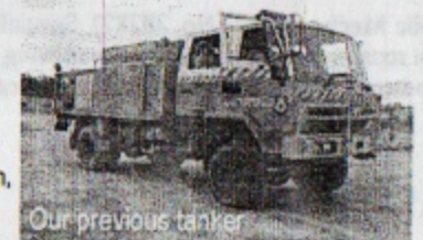
Our previous tanker