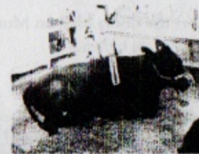
Cow set up to measure methane production!! Tocal Field Day in May

Information taken from a NSW Agriculture brochure.