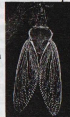
Yellow Monday or Green Ground after emerging.

It has been a particularly prolific year for cicadas as you are no doubt aware. The cicada has a 13 to 17 year life cycle. All but one month of the cicada's life is spent underground. Male cicadas have platelike membranes on the thorax which they vibrate like drumheads producing a loud shrill sound. The females of most species are mute. The female deposits her eggs ( up to 600) in slits that she cuts in young twigs. After six weeks the nymphs drop from the tree and burrow into the ground. Cicada's are sometimes kept for their song in the Orient, as they were in Ancient Greece. Cicadas have the longest known life cycle of any insect.