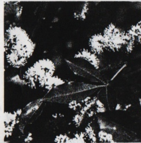
White Euodia ( Melicope micrococca )

Flowering in our area now. A rainforest tree with numerous clusters of small white flowers. They are visited by many birds, butterflies and other insects. Worth planting to provide for native fauna.