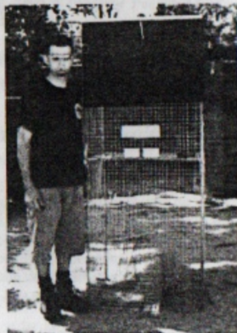
Selective Valve trap

The top most significant pests in NSW are Feral Cats, Indian Mynah and Cane Toad www.abc.net.au/wildwatch/results/maps.htm