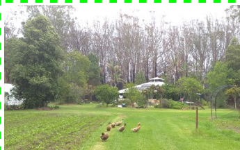
Asset protection zone around house and gardens, burnt trees at rear.