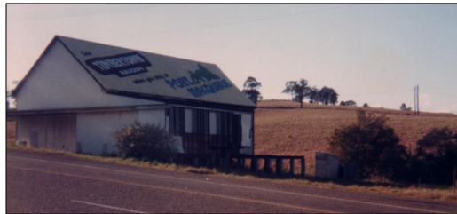
The Wootton Hall before it was demolished in the 1980s

She finally commented, "It's never boring, living in Wootton".