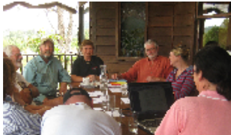
Fire Brigade discussion group held on the verandah at the cafe

Please note the Brush Turkey café will be closed for the months of July and August to allow for a well earned break. Over that time we will be holding 2 working bee days to refurbish the café and work on the garden.