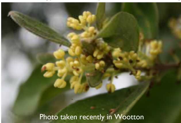
Photo taken recently in Wootton

A bushy shrub or small tree growing in or on the fringes of all types of rainforest, particularly the drier scrubs and also Eucalypt forest. The plant is characterised by their long leathery leaves. The yellow racemes flower from May to September followed by the purplish/black oval drupe shaped fruit ripening November to February. The fruit is a major source of food for the native doves and pigeons which are often seen feasting on the tree. The creamy coloured bark is covered with conspicuous white lenticels (raised dots).