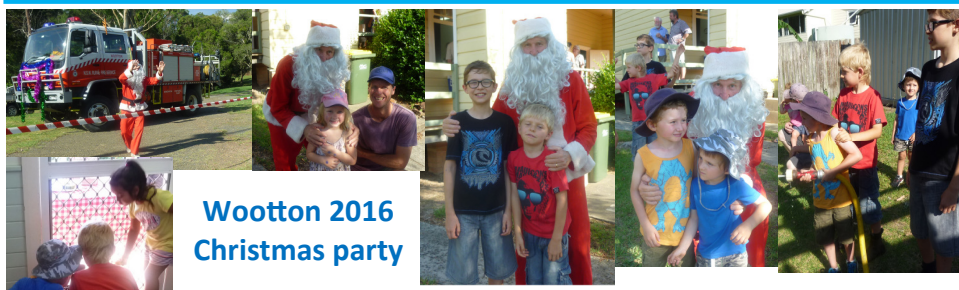
Wootton 2016 Christmas party