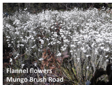
Flannel flowers Mungo Brush Road

Advertising for Wootton Valley News Directory $50 per four line ad space (6 issues)