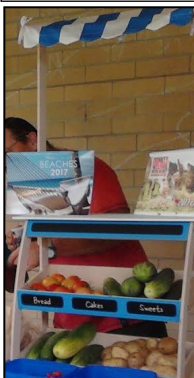
New display at Food Swap

Police Update: Between 7 and 14 January 2017 unknown attended a rural property adjacent to the Wootton Way. They attempted to force a lock off a shipping container. They also forced the lock to the storage shed nearby by and removed two unregistered motor cycles and a toolbox. It is believed that more than one person may have been involved. If anyone knows of anybody coming into possession of motorcycles around this time police would appreciate a call. Senior Constable Trevor McLeod, Bulahdelah, 49974204