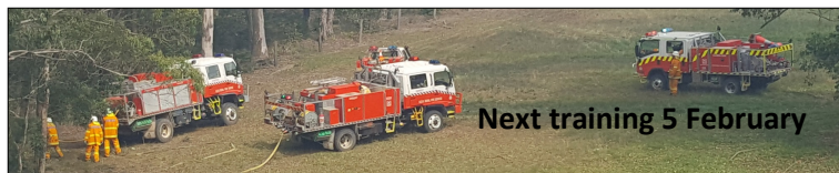
Next training 5 February

Police Update: Between 7 and 14 January 2017 unknown attended a rural property adjacent to the Wootton Way. They attempted to force a lock off a shipping container. They also forced the lock to the storage shed nearby by and removed two unregistered motor cycles and a toolbox. It is believed that more than one person may have been involved. If anyone knows of anybody coming into possession of motorcycles around this time police would appreciate a call. Senior Constable Trevor McLeod, Bulahdelah, 49974204