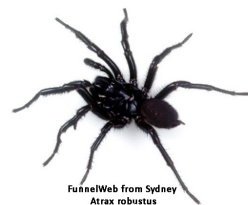
FunnelWeb from Sydney Atrax robustus