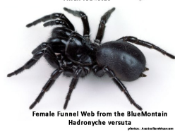
Female Funnel Web from the Blue Mountains Hadronyche versuta