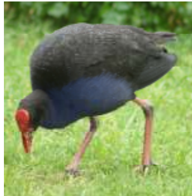
Swamp Hen eating grass seed on my lawn Pat

New advertisers welcome contact the editor.