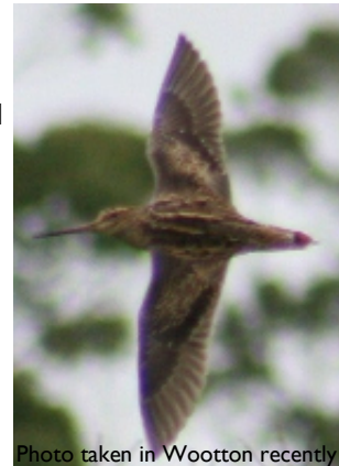
Photo taken in Wootton recently

Latham's Snipe is the largest snipe in Australia, with mainly brown, plumage. It's distinctive feature is it's long straight bill. It's wings are short and pointed and the tail is long. The upper body is boldly patterned with black, brown and white. Their eyes are set high to give a wide field of vision. Snipe are very shy and wary and burst from cover when disturbed. This is often the first indication that they are around, as they are usually well-camouflaged when still. It feeds by thrusting their long bill into mud with an up and down 'sewing machine' action in soft mudflats or shallow water. They roost in the day and feed at night, early morning or evening. They are omnivorous, eating seeds and plant material, worms, spiders and insects, some molluscs, isopods and centipedes. They favour wet treeless tussocky grassland. It breeds in Japan and on the East Asian mainland. The males have spectacular display flights, rising in the air and then diving to the ground, in courtship or to defend territory. It is a migratory wader, moving to Australia in our warmer months. Birds may fly directly between Japan and Australia, stopping at a few staging areas. They leave their breeding areas from August to November, arriving in Australia mainly in September. They leave the south-east by the end of February, moving northwards along the coast. Most have left Queensland by mid-April.