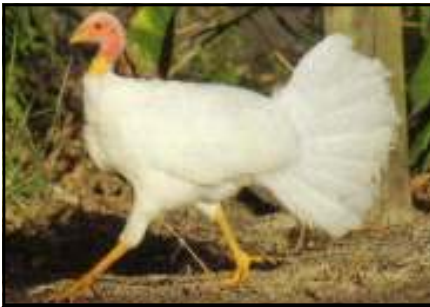
Image of a rare albino brush turkey.

Another experience was sitting on the verandah having a cuppa when a Paddy melon (wallaby) hopped by. I stayed motionless getting prime viewing of the beautiful animal. I sat like a statue both of us looking intently at each other. I must have sat still for 5 minutes admiring it's lovely features. If the mosquitoes hadn't be biting so hard I could have sat there for ages. My first flinch at swatting a mozzie and it was off. The things you see in the country that enrich your life.