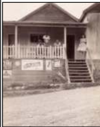
Wootton General Store in the 1950's showing the unsealed highway out the front.