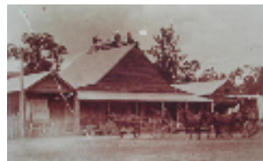
Old photo of Coolongolook