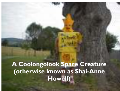
A Coolongolook Space Creature (otherwise known as Shai-Anne Howell)

The creatures from outer space have invaded! There was an invasion during the week at Coolongolook Public School. The classrooms and playground were covered with UFO's and